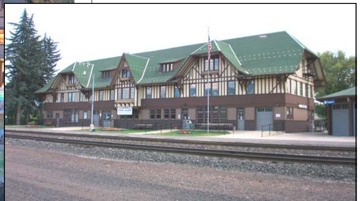
The Whitefish train station