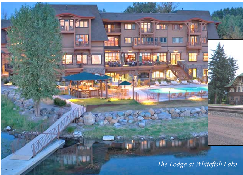
The Lodge at Whitefish Lake