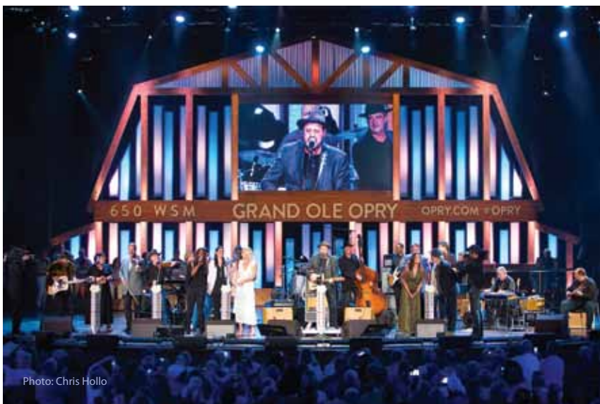
Experience a show at the Grand Ole Opry

6 music-filled days! WAS $2899 per person/do NOW only $1699 for a limited time! Single supplement $699 Land Only