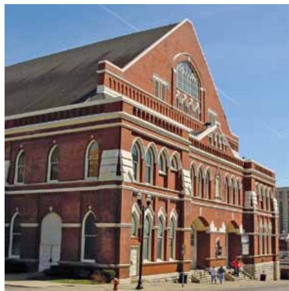
Legendary Ryman Auditorium