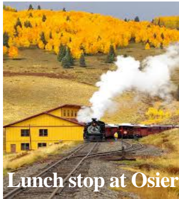
Lunch stop at Osier