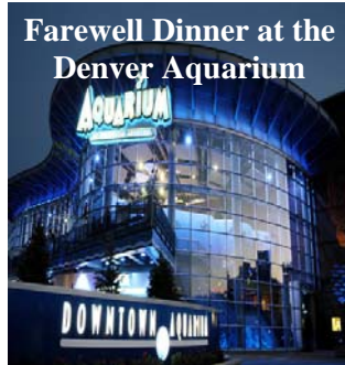
Farewell Dinner at the Denver Aquarium