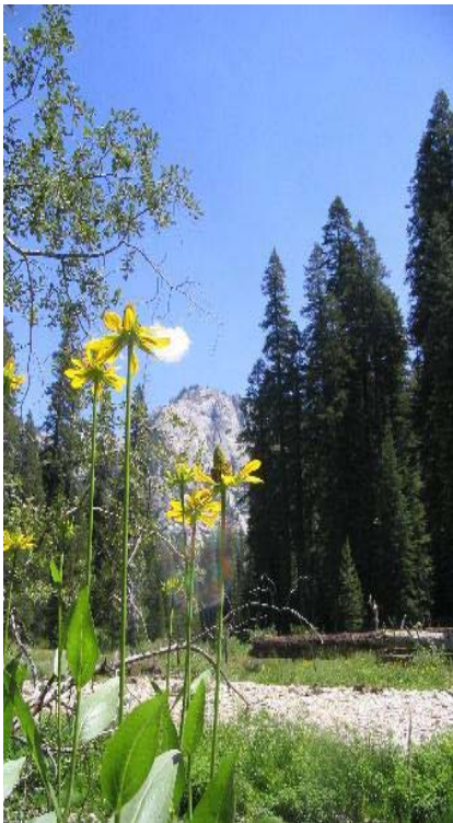
Sequoia National Park